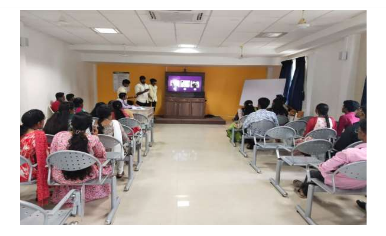
Quiz competition held in Video Conferencing Hall