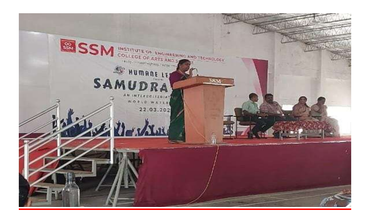
Chief Guest speech about water scarcity